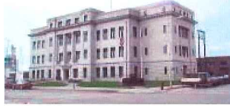
435 North Park, Fremont Nebraska 68025